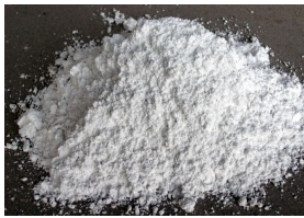
Figure 1: NHL