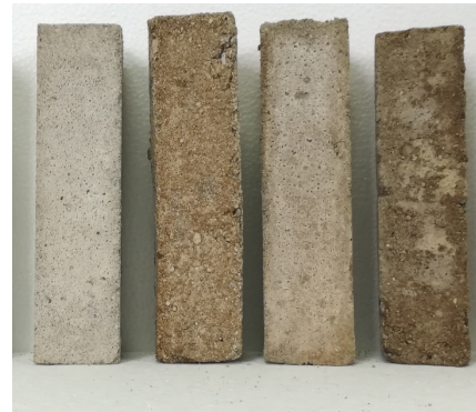
Figure 3: NHL mortars specimens