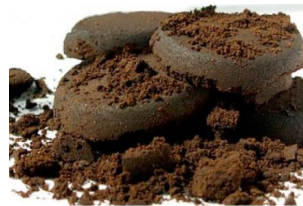
Figure 2: SCG

The foreseen use of NHL-mortars manufactured with different SCG waste quantities is a plastering application for architectural finishing with innovative insulating performances. By adding increasing quantities of SCG in substitution of the traditional sand, mortars mix are designed in order to improve the material performance, along with its sustainability. In this regard, the aggregate is prepared by substituting increasing quantities of sand by SCG (i.e. 5 %, 10 %, 17.5 % in volume) until the material does not become too viscous to be appropriately mixed (cfr. flow table test). Four different formulations are considered as listed in Table 2.