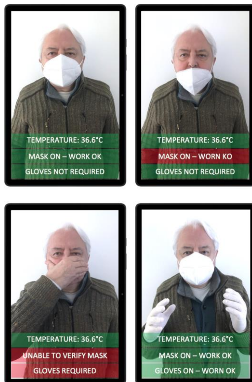
Fig. 1. Mask and gloves control, color code

path for blocking people coming from suspicious places and confining them before can spread the virus.