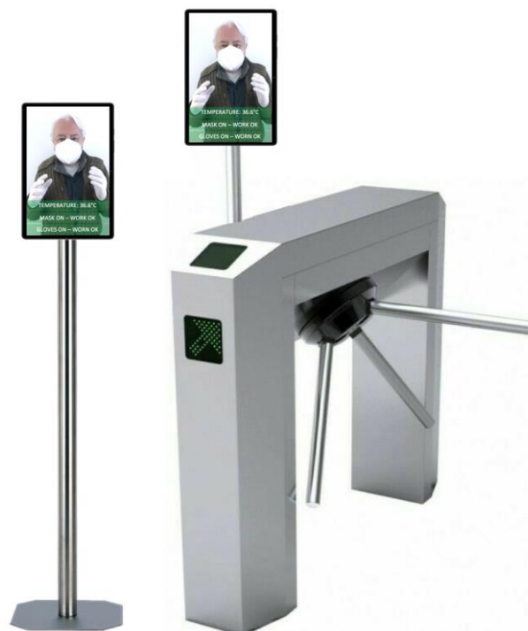
Fig. 2. Thermoscanner controls on User interface