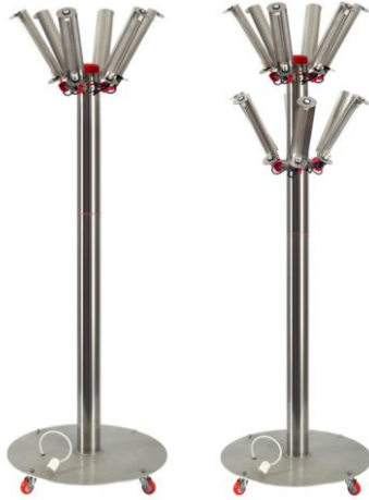
Fig. 3. UV-C and Ozone Sanitization machines

Paper [23] describes how an operator can simultaneously handle 2 machines deployed in adjacent rooms, disinfecting an environment of 100m 3 with a UVC-Ozone machine equipped with 12 lights of 14W/each in 20 minutes. Positioning, turning on, and shutting off are the main actions taken. As part of routine duties, the cleaning staff is typically given these responsibilities (it takes about 20 minutes at the end of each shift).